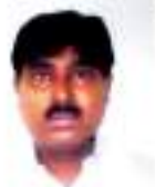
Photo of the presentant should be pasted in the front page of the document